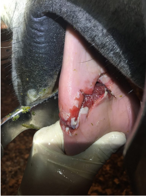
Injury on Hattie's arrival

The emergency vet was called and Hattie attended to find a very unusual injury to Lenny's tongue. The tongue had an almost full thickness jagged laceration to the top surface with a complete tear of the frenulum on the underside (the bit that connects the tongue to the floor of the mouth).