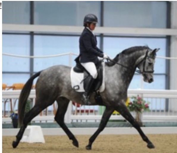
Lenny during dressage

Lenny made an excellent recovery thanks to his very caring owners and is now back in full work with no long term effects from his traumatic autumn evening!