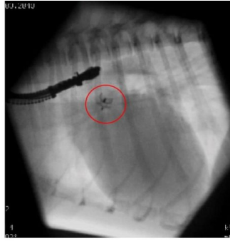
ACDO device in position (red circle)